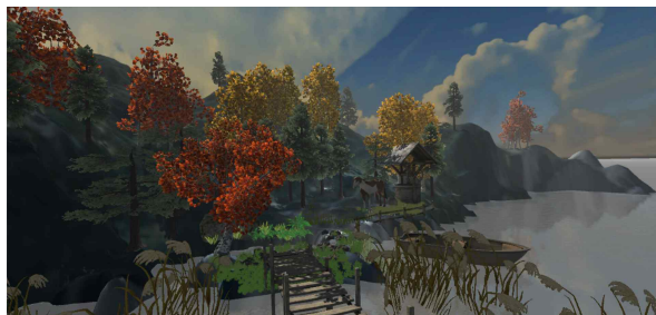
[Figure 3] A detailed closeup of the scene through a first person perspective.

We present a detailed look at a selected region of interest through a virtual UAV moving along a pre-determined path. To simulate possible usage scenarios in the real world, such as drone surveillance or teleoperation, the camera is set to a first person point of view as shown in [Figure 3]. In this view, the touch interface is disabled and an in-air gesture is used to return to the overview map.