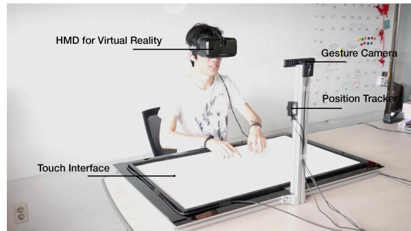
[Figure 4] The physical setup of our prototype with labelled components.

The Nexio 2D Touch Frame is the tabletop component in our system and was chosen so that it could be installed at workstations and used by professionals. With the proliferation of smartphones and other touch devices, touch interfaces are very commonly used and so a large touch surface was employed to provide a familiar and intuitive interface. We also used an Intel RealSense F200 depth camera in conjunction with the touch tabletop to track in-air gestures as depicted in [Figure 4]. As we are using an Oculus Rift DK2 to immerse the user in virtual reality, the depth camera allows us to simulate a physical presence in the virtual environment.